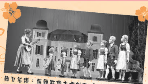
節目名稱：薩爾斯堡木偶劇院《仙樂飄飄處處聞》 演出地點：元朗劇院演藝廳 演出日期：2020年2月29日及2020年3月1日 售票處：城市書院圖書票處

以奧地利為背景的音樂劇《仙樂飄飄處處聞》風行六十多年，劇中的木偶戲《The Lonely Goatherd》靈感正是來自國寶級的薩爾斯堡木偶劇院！劇院於2016年獲聯合國教科文組織評為世界非物質文化遺產，今年一家大小毋須長途跋涉，在元朗劇院便可與一眾可愛的木偶度過開心愉快的時光。